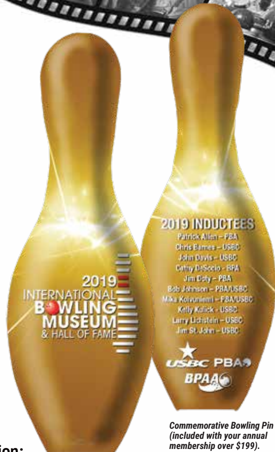
Commemorative Bowling Pin (included with your annual membership over $199).